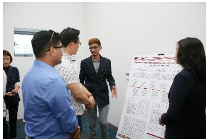
<Poster session of the 2018 NEREC Conference>