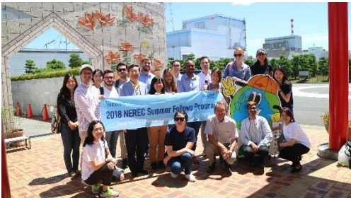
<Tokai Daiichi Nuclear Power Plant>