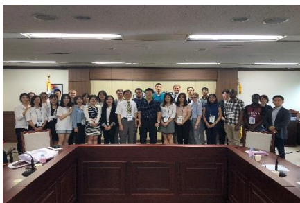
<Korean Institute for National Unification>