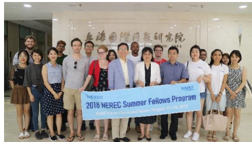
<Shanghai Institutes for International Studies>