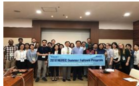
<Seminar at Korea National Diplomatic Academy>