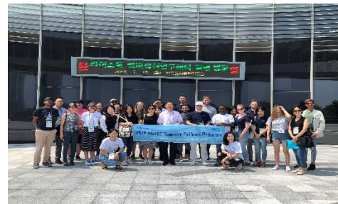
<Korea Radioactive Waste Agency>