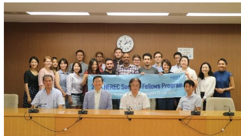
<Japan Institute of International Affairs>