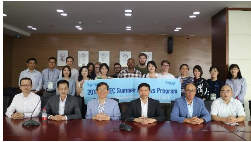
<IWEPP/Chinese Academy of Social Science>