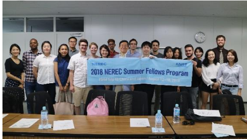
<The Institute of Energy Economics, Japan>