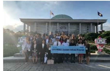
<The National Assembly Building>