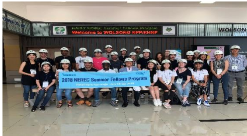
<KHNP/Wolsung Nuclear Power Plant>