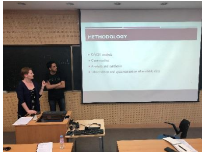
<Group research proposal presentation>