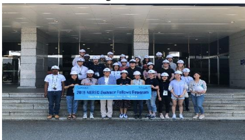
< Doosan Heavy Industry>