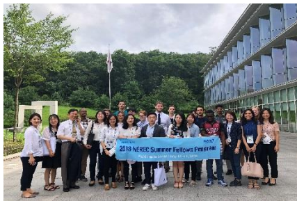
<Ministry of Foreign Affairs>