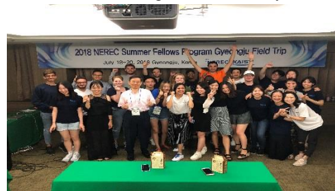
<After the fantastic Talent Show>