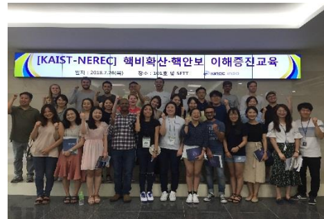
<Korea Inst. for Nuclear Nonproliferation & Control>