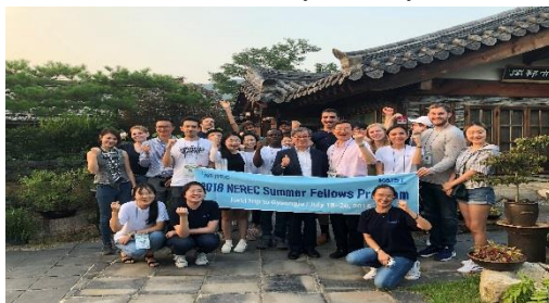
< Bulguksa Temple>