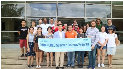
<Nuclear Engineering, Shanghai Jiao Tong University>