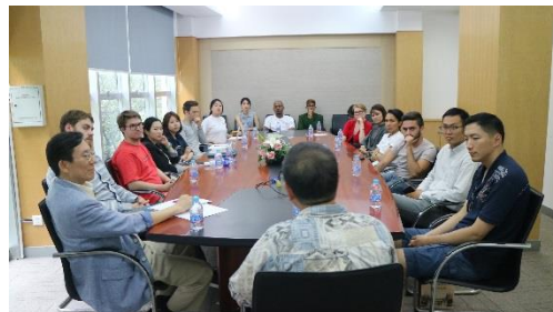
<Discussion at Fudan University>