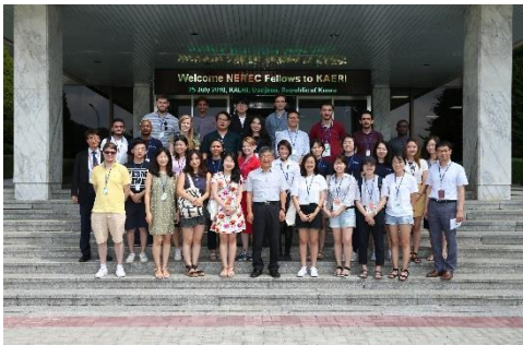
<Korea Atomic Energy Research Institute>