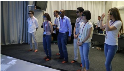
<VR system tour at Japan Atomic Energy Agency (JAEA)>