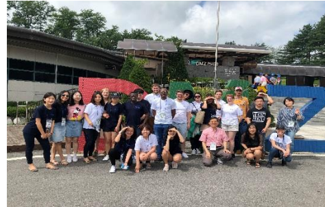
<DMZ Security Tour>