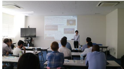
<Nuclear Security Seminar, JAEA>