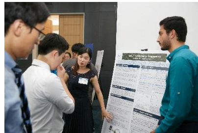
<Discussion with a Conference participant>