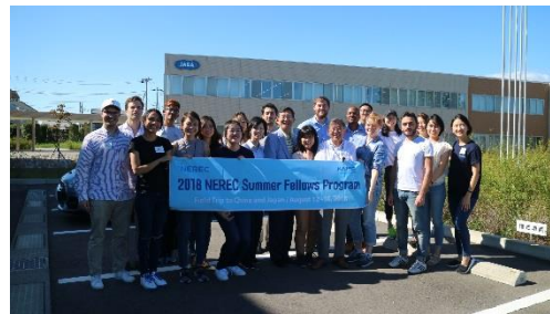
<Nuclear Security Training, JAEA>