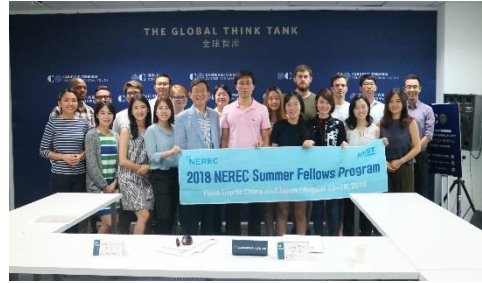
<Carnegie-Tsinghua Center >