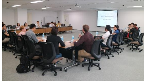
< Q&A session at IEEJ>