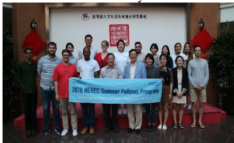
<Institute of International Studies, Fudan University>