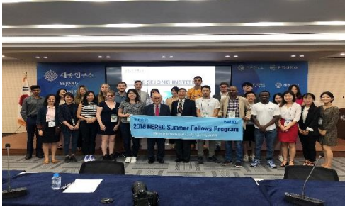
<The Sejong Institute>