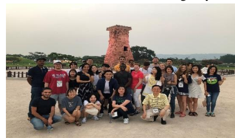
< Cheomseongdae Observatory>