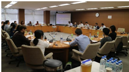
<Seminars at Japan Institute of International Affairs>